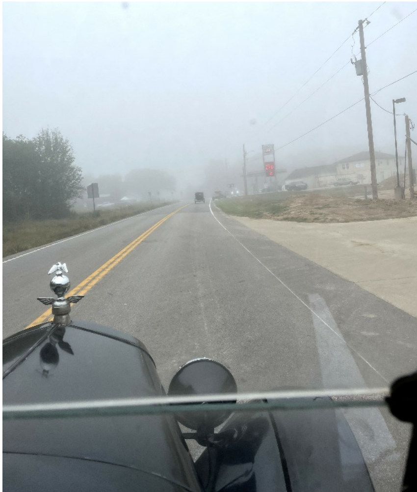
A foggy start to the annual Fall Tour

The Model T Ford Club of America (P.O. Box 996; Richmond, IN 47375-0996) was formed to encourage and promote active interest in the Model T Ford and its history by membership unrestricted as to location. It is non-profit and non-discriminatory, and is dedicated to widening the base of the hobby by providing information, assistance, and direction to interested parties. Sample copies of their magnificent magazine, The Vintage Ford , are available free upon request at the above address. Active touring chapters are encouraged, in order to spread interest and participation events. Regional and national activities are provided by the chapters. Annual dues to the MTFCA are $50.00. Members of the MTFCA may be members of the Model T Ford Club of Greater St. Louis with discounted local dues. For further information on joining, see inside the back cover. Also check out our website: www.stlmodeltclub.org .