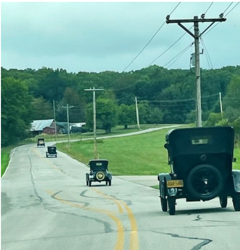
On the road again! Some of our cars on the annual Fall Tour.

Celebrating the Model T in St. Louis Since 1963