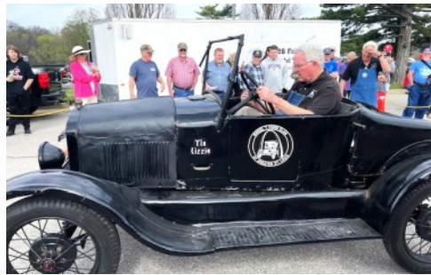
Right, our line up of cars, photo courtesy of Gayle Ellerbeck.