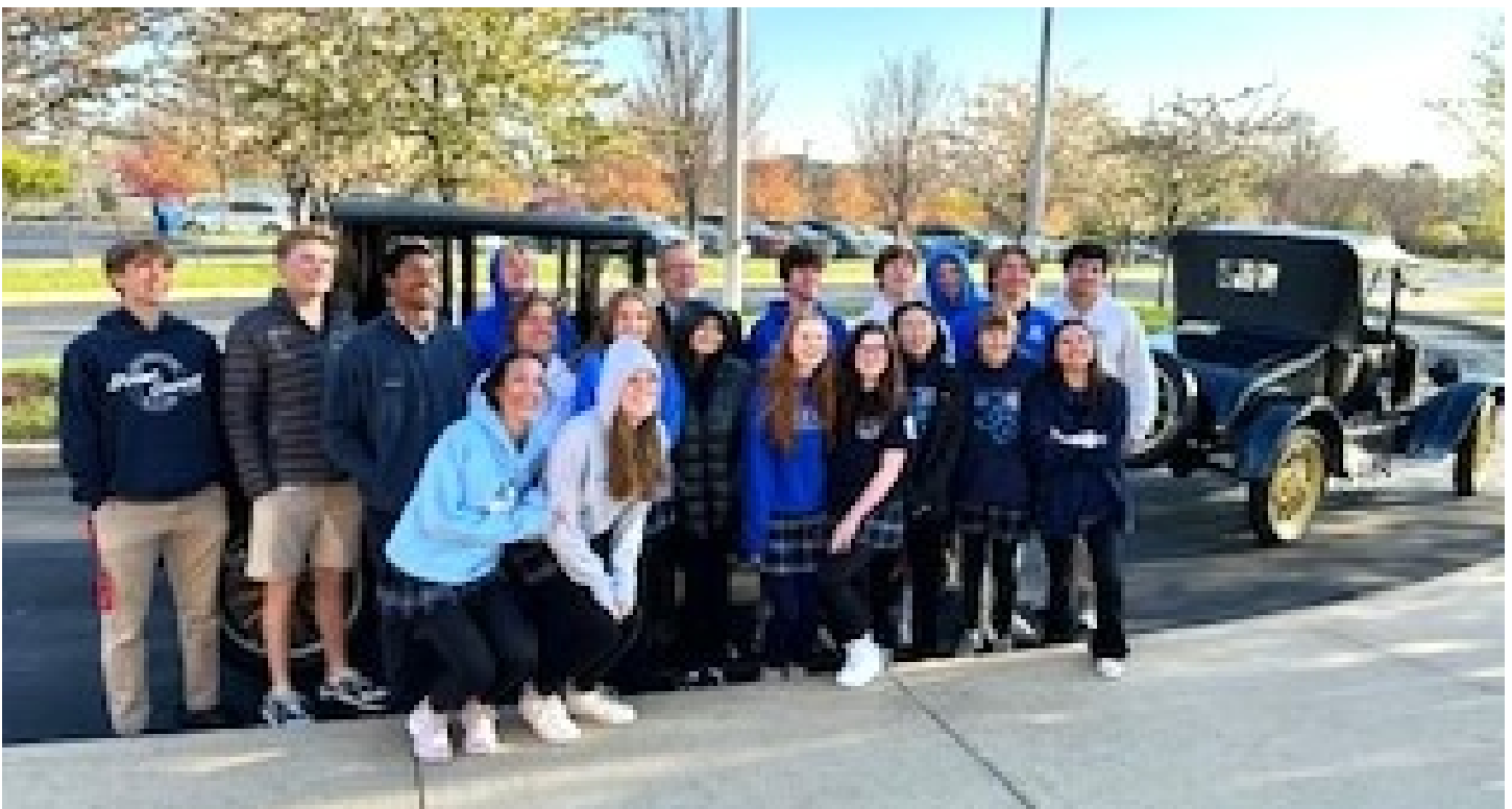
Westminster Christian Academy High School History Class, story page

Celebrating the Model T in St. Louis Since 1963