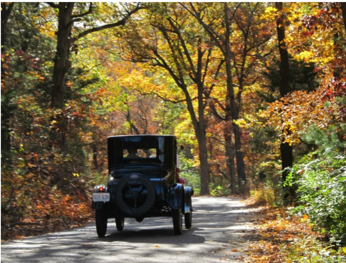
A beautiful Fall day for a drive in northeastern Jefferson County, the 2014 Annual Fall Tour.

The Model T Ford Club of America was formed to encourage and promote active interest in the Model T Ford and its history by membership unrestricted as to location. It is non-profit and non-discriminatory, and is dedicated to widening the base of the hobby by providing information, assistance, and direction to interested parties. Active touring chapters are encouraged, in order to spread interest and participation events. Regional and national activities are provided by the chapters. Members of the MTFCA may be members of the Model T Ford Club of Greater St. Louis with no additional dues or payment. For further information on joining, see inside the back cover.