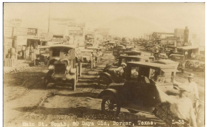
Borger, Texas, 1926 Boomtown, probably oil related