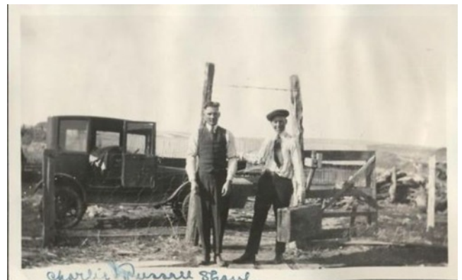
Fuller Brush salesman and his Model T, date and location unknown